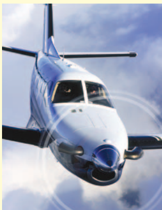
The TBM 700 is used throughout the U.S.

The result was a fast, cost-effective aircraft capable of carrying six persons at 300 KTAS over a range of 1,315 naut. mi. (2,435 km.). This made it the fastest civilian pressurized single propeller aircraft in production.