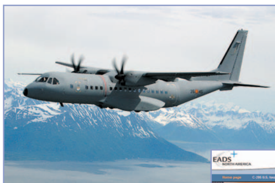
Alaska was one of the 10 states visited by the C-295

The EADS CASA C-295 transport's capability to perform these increasingly vital Army intra-theater lift missions was demonstrated during a 10-state "All American tour," which included 15 stops from coast-to-coast and north to Alaska.